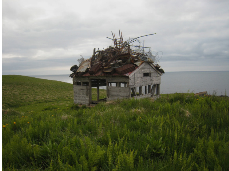
Installation on site. Art work by Hrafnkell Sigurðsson

From the start it has been our aim to make Galtarviti sustainable in every way as the location offers great opportunities to do so. Many archaeological remains and stories are connected to Galtarviti. In folklores we can read about elves in and around Galtarviti.